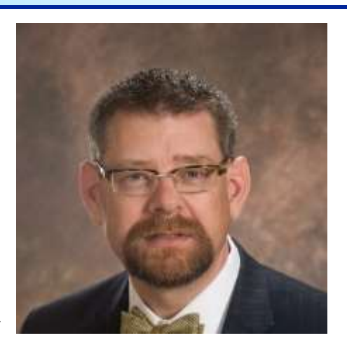
in success, but we must redefine what 'success' means.

We need a movement: a cultural shift in which parents, guidance counselors and others do not view vocational skilled-trades education/ apprenticeships as a second choice to going to college. Parents want their children to exceed them